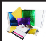
Poly Bags, Mailers & PLE's